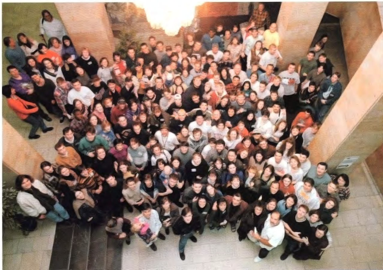
Some of the 450 conference attendees pose for a photograph in the lobby of the hotel.

Pastors from the United States and Europe come to teach and encourage those who have dedicated their lives to ministry in Russia and the surrounding countries. Missionaries who have served for many years in the field also participate in the teachings. Special worship is led by the worship teams from several of the fellowships in Russia.