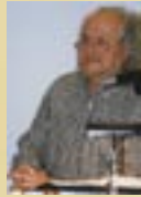
Soaking up God's Word