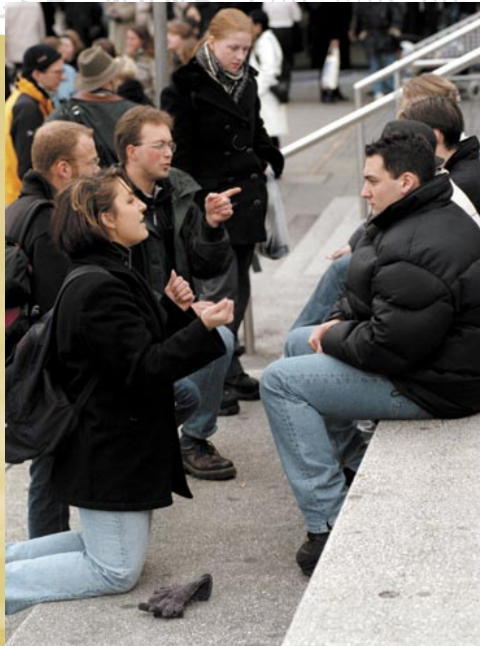
Outreach team witnesses to young Germans at the center of the city.

FOR GOD SO LOVED THE GERMANS FOR GOD SO LOVED THE GERMANS GERMANS FOR GOD SO LOVED