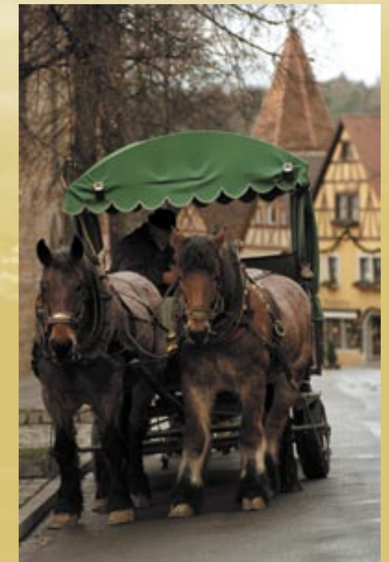
Horse-drawn carriage transports tourists in historical German city of Rothenburg.