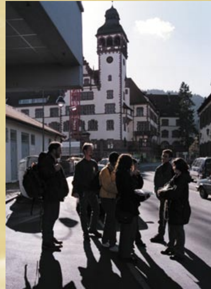
Leaving Calvary Chapel to begin outreach in Freiburg.