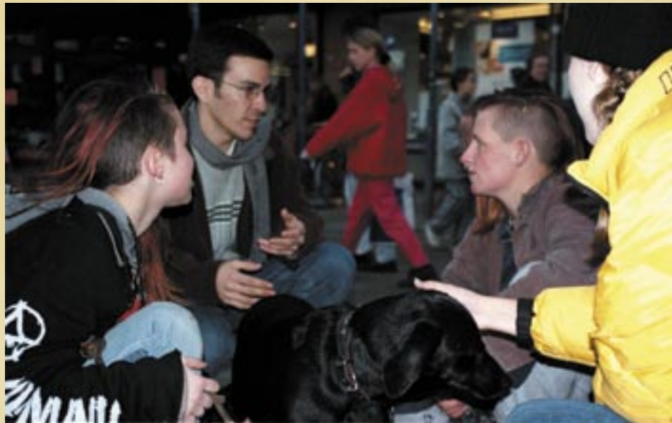
Team members from CC Bible Fellowship in Temecula, CA share with girls from Germany.