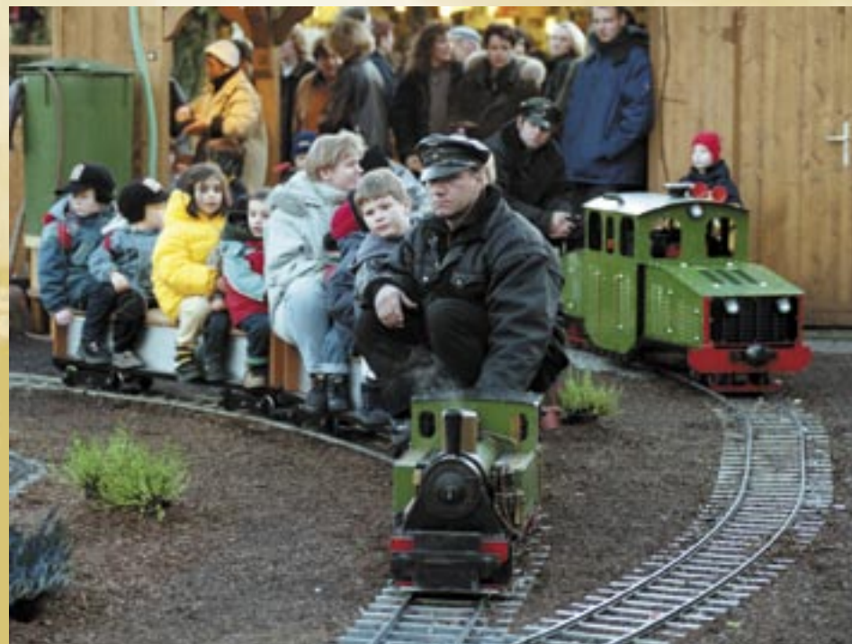
Children ride a miniature train in the Christmas Mart in Stuttgart.