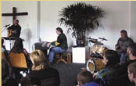
Praise team of CC Hannover