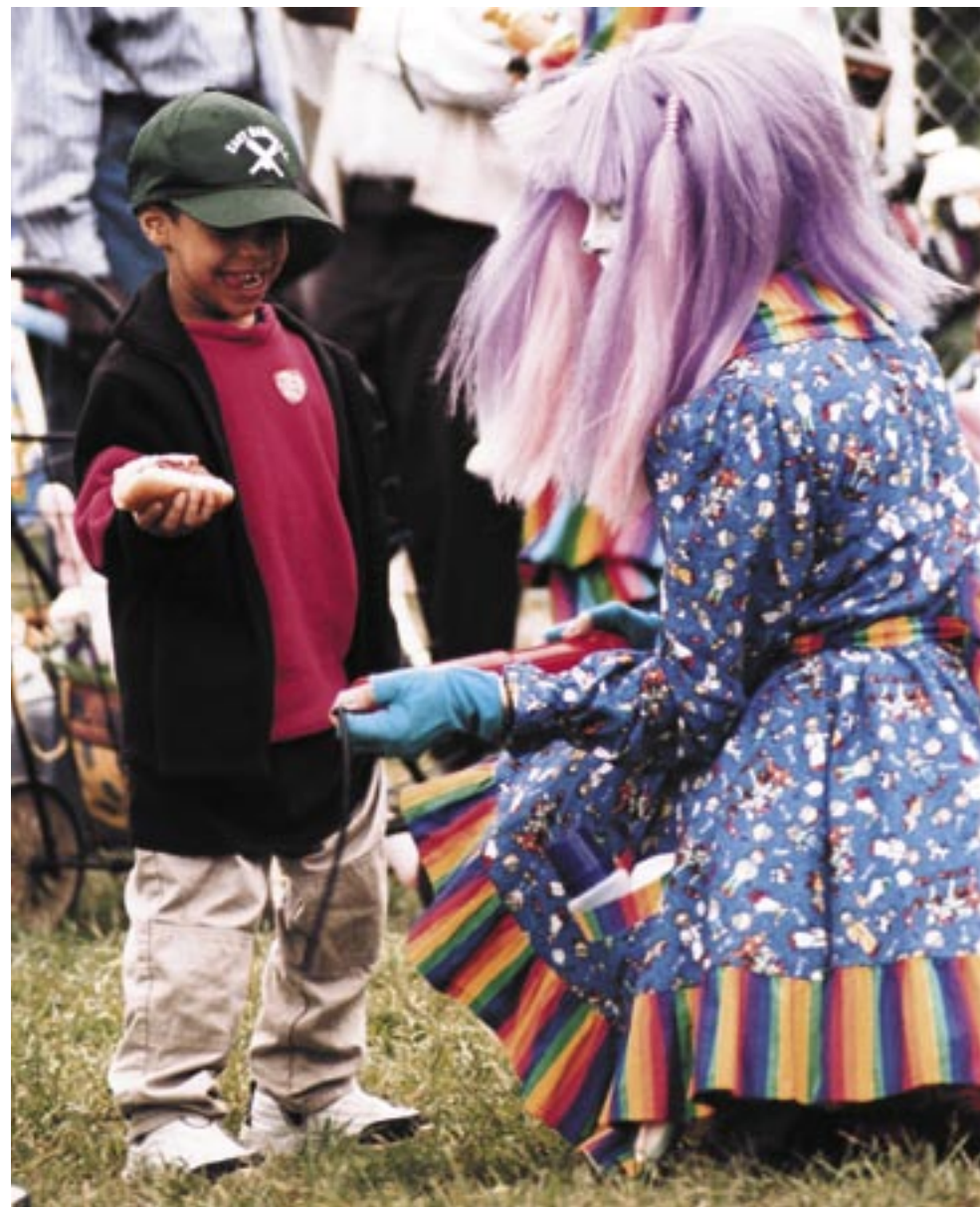
An enthralled child expectantly waits for a balloon animal from a member of the clown community.

The Anniversary of September 11th ushers in new opportunities for the