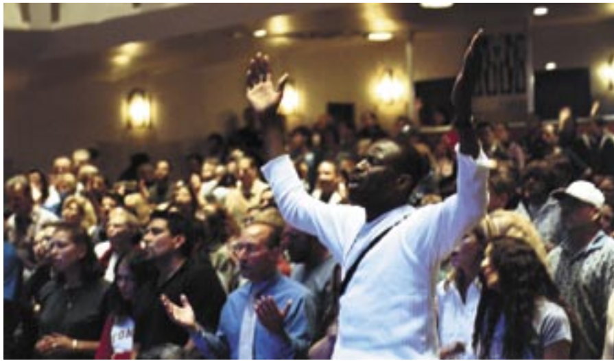
Participants in the Festival of Life praise the Lord.