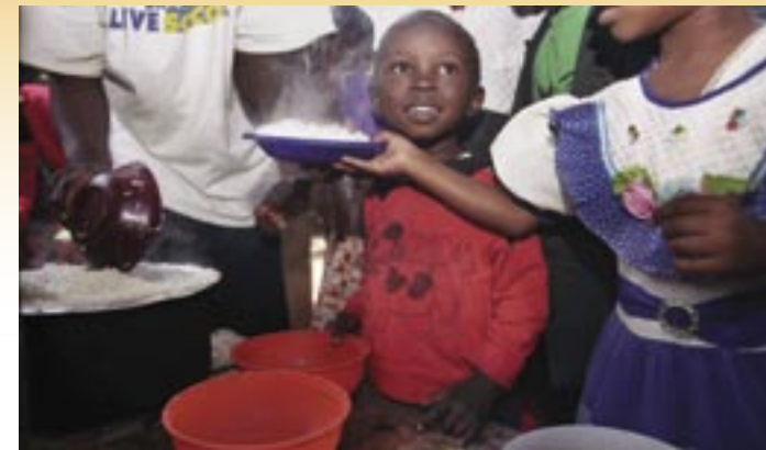
Children receiving food at Sons of King Jesus orphanage outside of Nairobi.