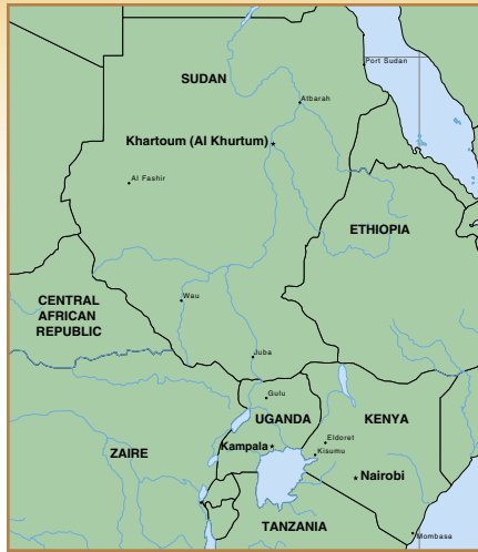
Eastern Africa: Sudan, Uganda, Kenya