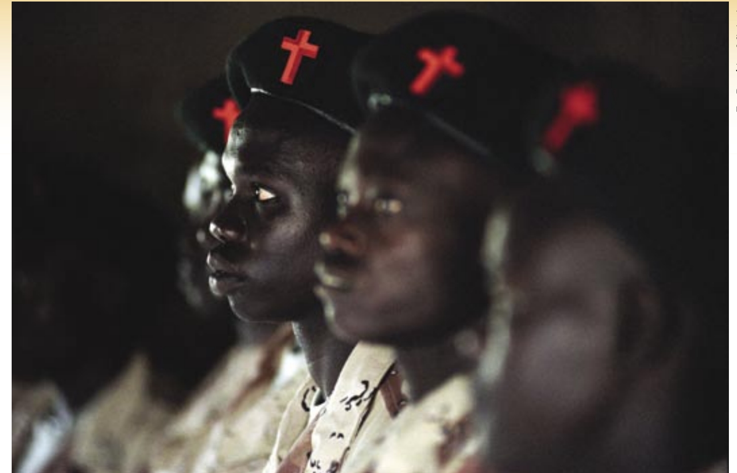
Graduating chaplains receiving their final instructions the morning before being ordained.

Since 1984, Sudan has been in civil war as a result of the regime trying to force strict Islamic rule on its Christian and animist populations. Government of Sudan forces have routinely bombed civilian villages, hospitals, and schools. They've hosted terrorists training camps and have been a leading persecutor of Christians. FRM graduated its fourth class of chaplains. They will minister in a country where 2.5 million people have been killed and 4.5 million people have been displaced by the war.