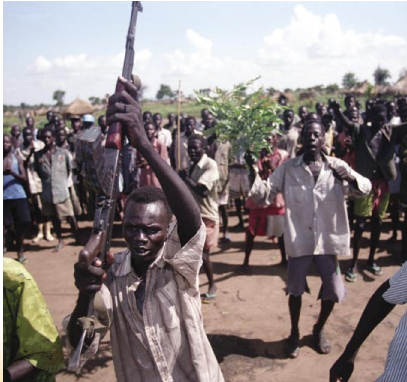
SPLA soldier rejoices in a time of praise at FRM training camp.