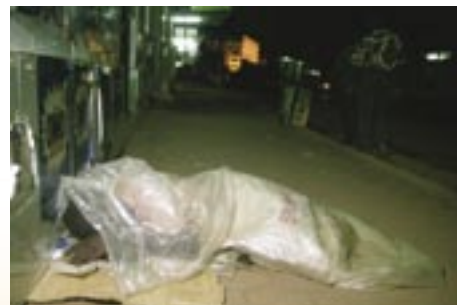
Children sleeping on the streets of Kampala.