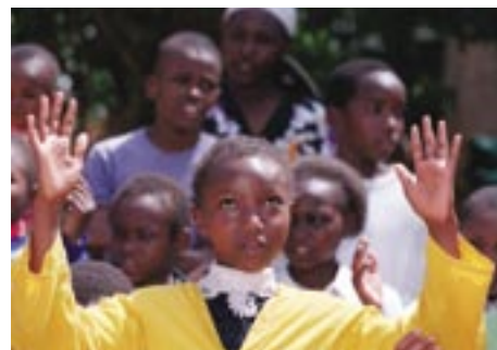
A young girl lifts her hands during worship at Sons of King Jesus orphanage.

Far Reaching Ministries has sent missionaries from several Calvary Chapels to the orphanages. FRM has been instrumental in establishing Calvary Chapel of Nairobi. In Uganda, they partner with Saving Grace Calvary Chapel to operate a refugee village for those fleeing war-torn Sudan. They are