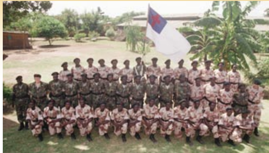
Graduating class of SPLA chaplains.