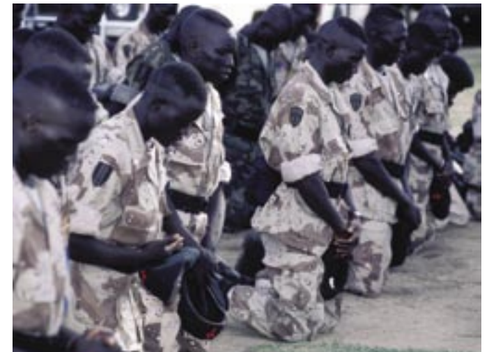
Graduating chaplains being ordained at the Far Reaching Ministries compound in Nimule, Sudan.

Getting up from their prayer, the newly commissioned chaplains are greeted by tribal songs and shouts of encouragement. A cow has been butchered for the feast, and soon there will be praise music as only Africans can sing. The afternoon will be spent in celebration, but two days later, they will head to the war's front, some never to return.