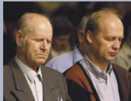
Many were moved to tears during the radio rally.

“What really moved my heart was the people’s appreciation for the teaching of the Word of God.”