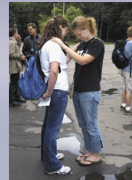
At the end of the radio rally evening, many prayed together.

"I never thought that I would ever see the day where the doors would be open such as they are now and the opportunities to go in and to minister."