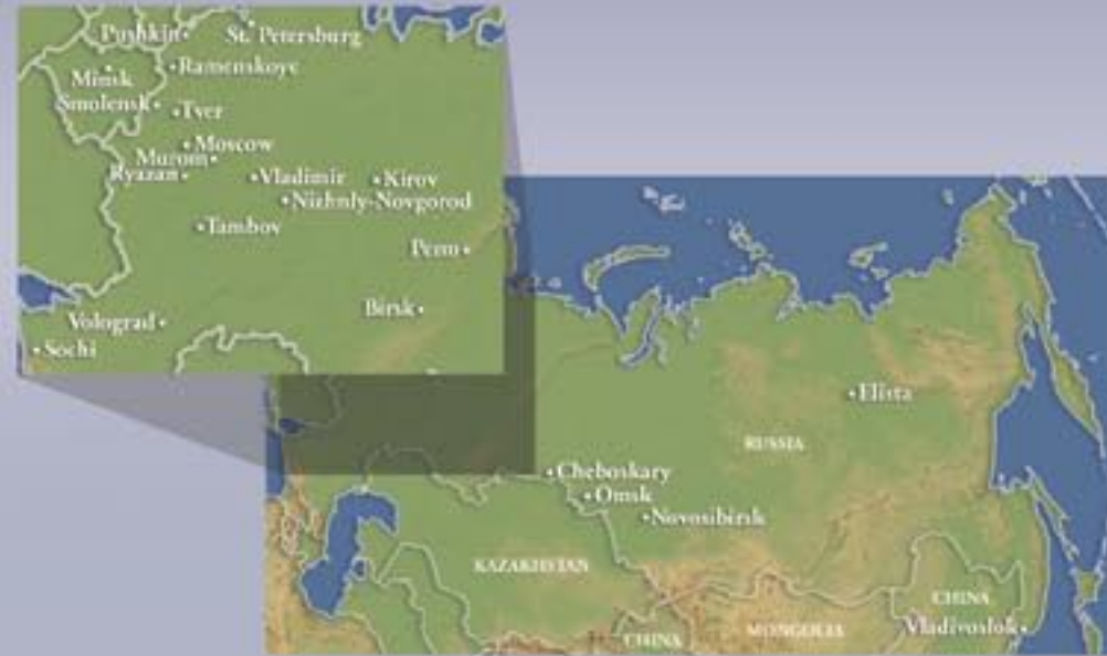
There are five Calvary Chapels in Moscow and three in St. Petersburg.