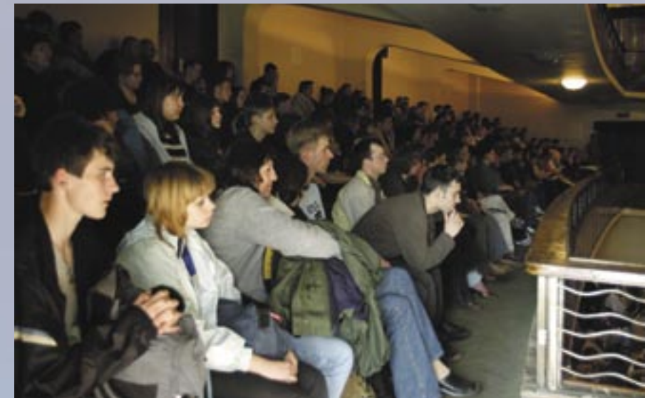
When the older believers arrived for the radio rally, those from Calvary Chapels gave up their seats and moved to the balcony.