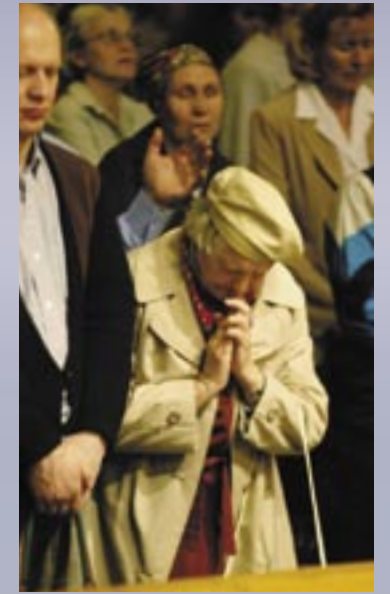
Many responded to the message with deep emotion.