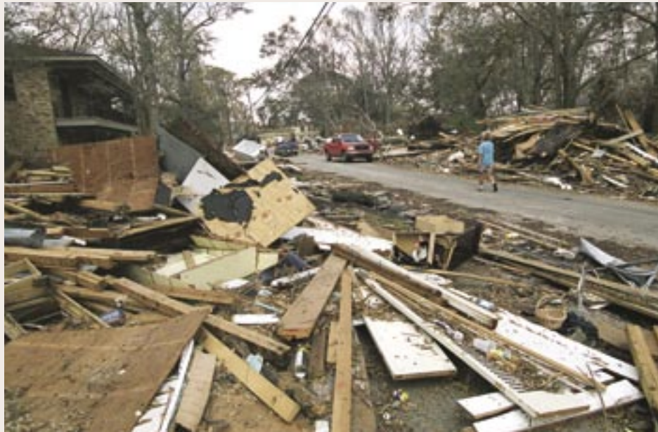
Communities on the Gulf Coast lay in ruin after the storm surge came inland.