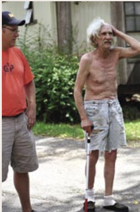
An elderly man in a mobile home park waits to receive relief goods.