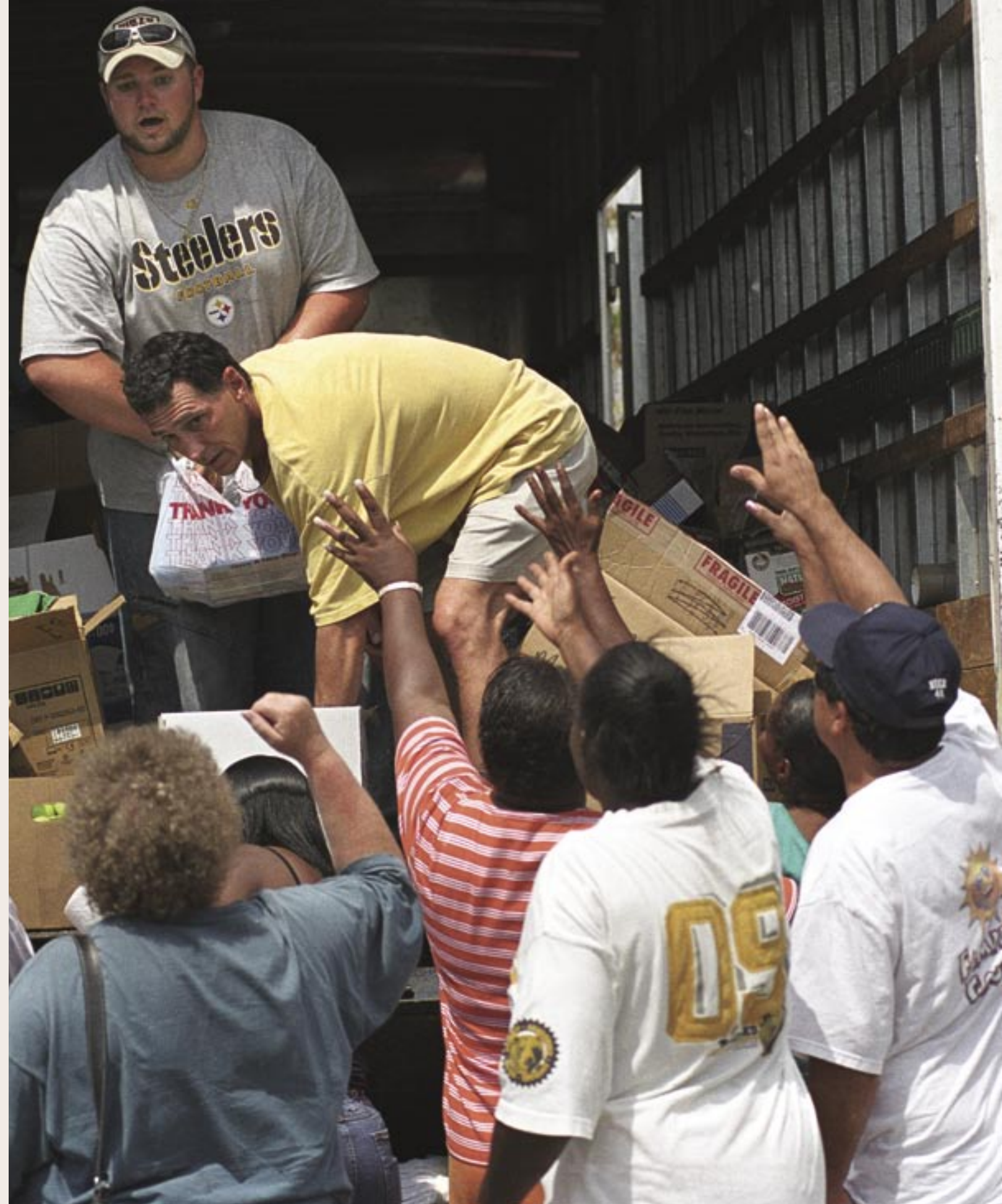
Volunteers from Calvary Chapels in Virginia unload supplies in areas where no other relief agencies had visited.