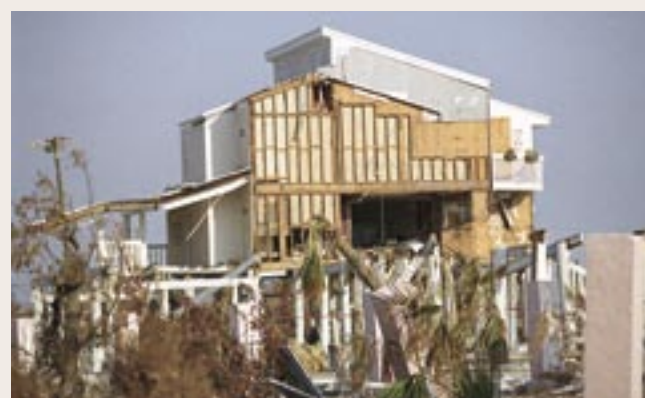
Homes close to the Gulf were ravaged by the storm.