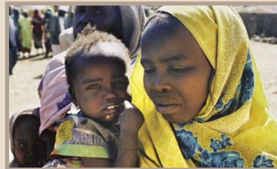
Refugees wait in line to be seen at the Safe Harbor medical clinic in Darfur.