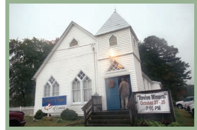
CC Louisa meets in a church in the town of Mineral, located in Louisa County, VA. Nearly 70 people attend the church.