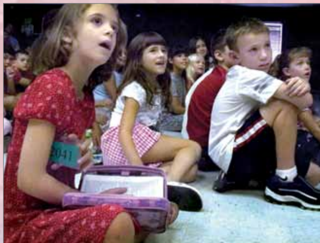
Children listen to the teaching at Sunday school.