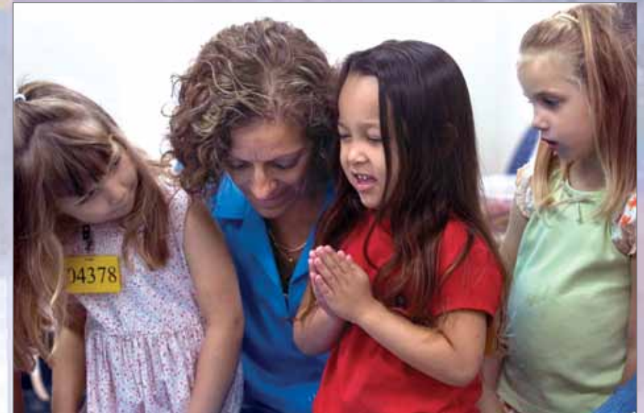
Children are encouraged to pray on their own during Sunday school.