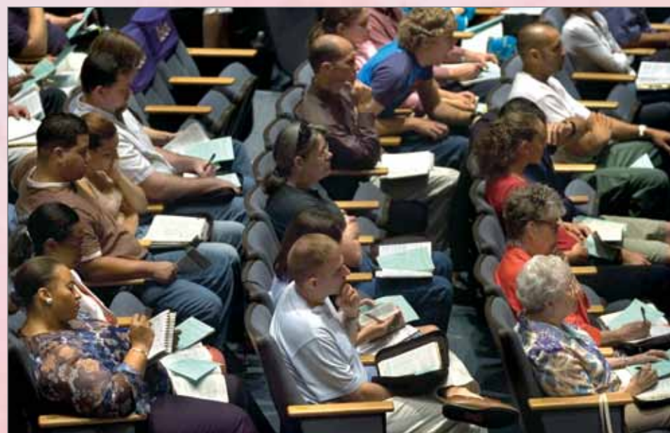
The congregation at CC Melbourne is ready with open Bibles for verse-by-verse teaching of God's Word.