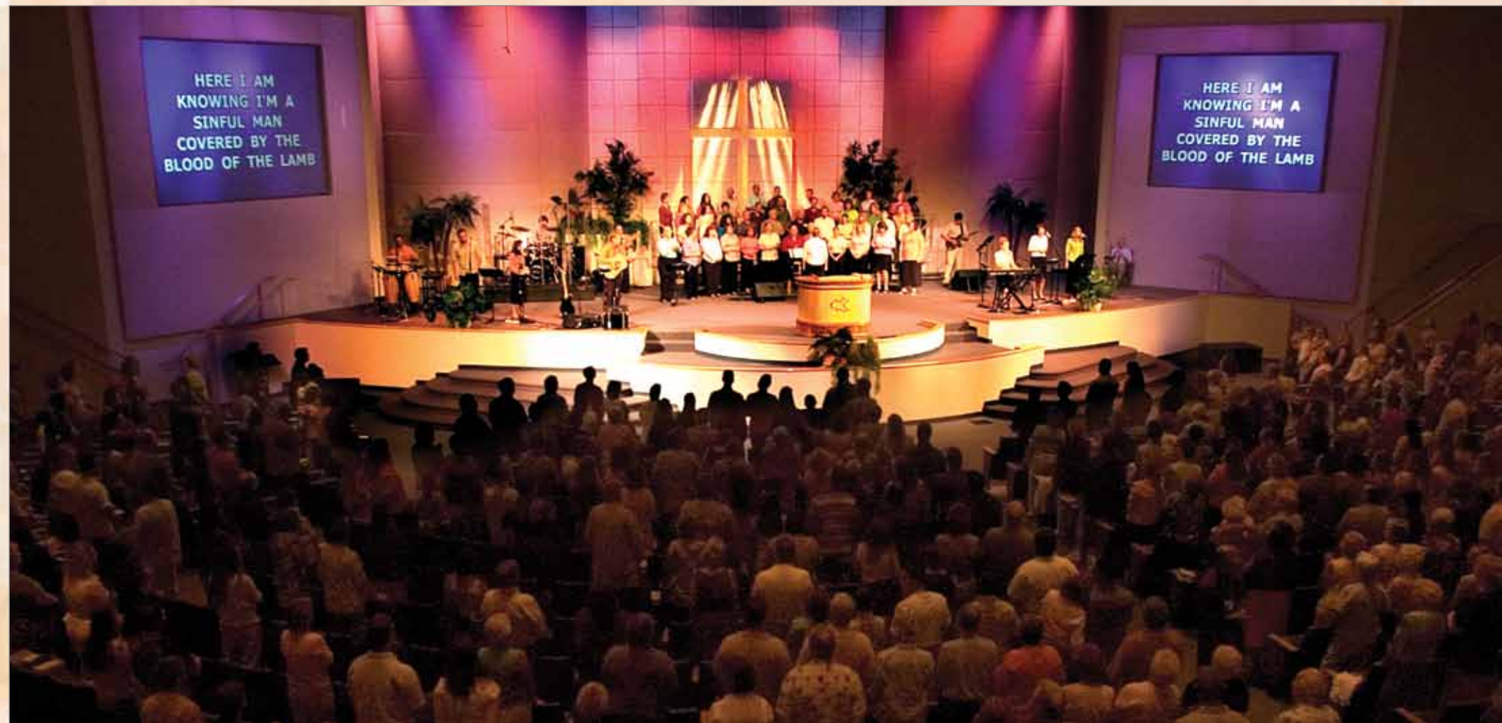
CC Melbourne, located in central Florida, has several services that minister to over 8,000 people. Though a big church, there are dozens of small group ministries available so people can connect personally. Many newcomers express that they feel the presence and love of God the moment they walk on campus; like they had come home.