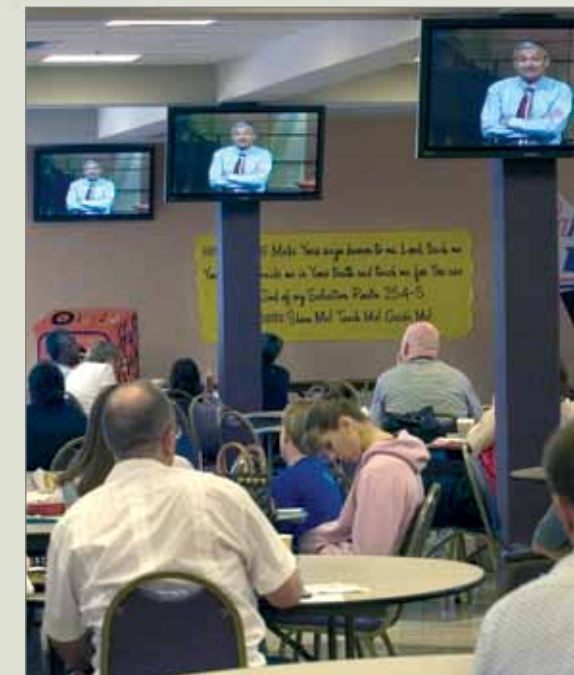
CC Melbourne has two other campus video venues used during services.

Young adults in the community are being reached through Fusion, a ramped-up worship service and Bible study on Sunday nights. They also join together in smaller groups at the church and in homes, as well as at a Tuesday evening prayer meeting.