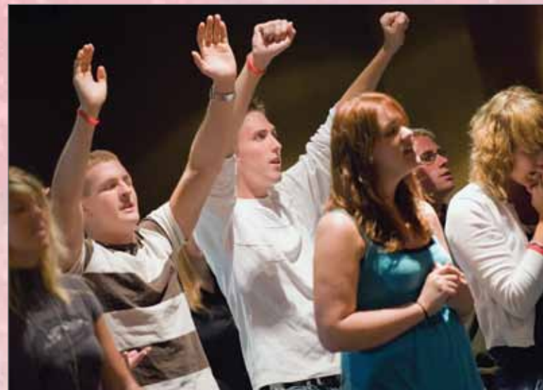
Young adults worship at CCM's Fusion service on Sunday evening.