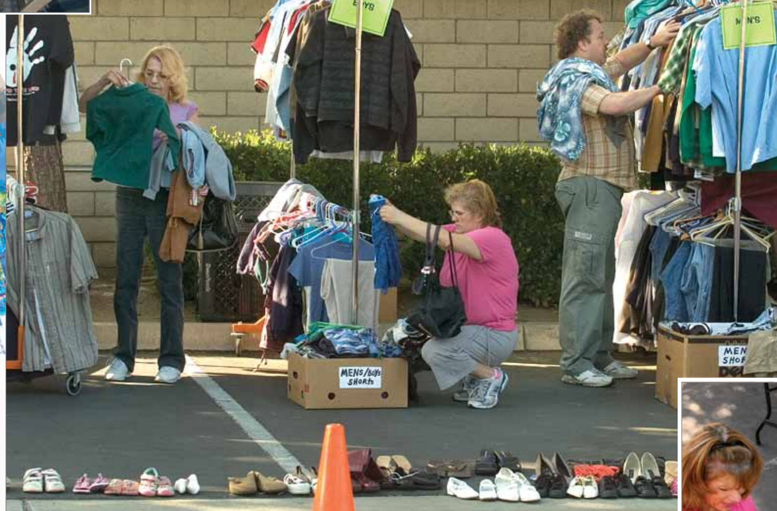
Volunteers from CC Murrieta usually spend a day restocking and sorting eight racks of clothing for the assistance now volunteer at the outreach and have come to Christ.