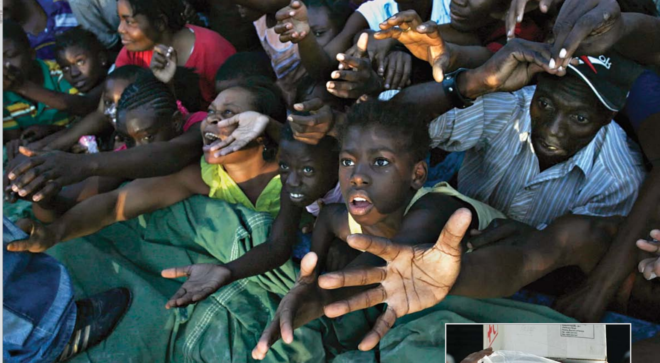
Outstretched hands and cries for help greet the relief team from Calvary Chapel as they bring crackers, bread, water, and juice to a park in Petionville, Haiti. Once being used as a tent city for thousands

The group set out the next morning and sped over the torn-up roads. After a few hours, the road became impassable. Seeing a policeman, the team slowed and asked him for advice about distributing their supplies. He counseled them to give the food away from the nearby police station. As the loaded truck pulled into the lot, onlookers