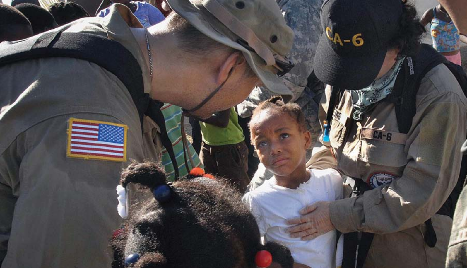
U.S. military personnel attempt to aid a Haitian girl after the earthquake. Many children were orphaned and thousands of Haitians were left homeless. Many now sleep in makeshift refugee camps.