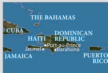
Haiti is 750 miles southeast of Florida. Several CC teams have ministered in various areas since Haiti's earthquake.