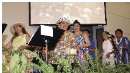
Native Hawaiians perform.