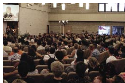
The sanctuary was filled to capacity.