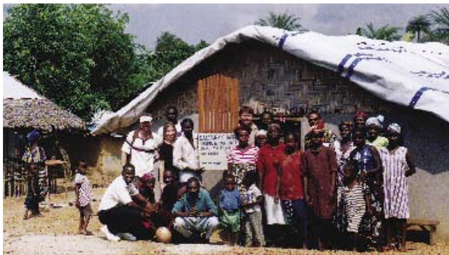
A Calvary Chapel conference was held in Liberia for the first time in five years. The extensive conflict had made travel extremely dangerous.