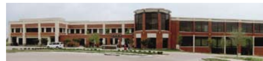
The Gospel for Asia facility has expanded to 61,000 square feet.

Gospel for Asia has over 14,000 native missionaries working in seven Asian nations. The Lord has used GFA to plant over 21,600 fellowships with more than 1.5 million first-generation believers attending these fellowships.